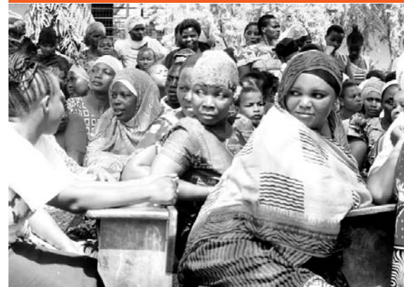
"School payments becomes the fathers decision"