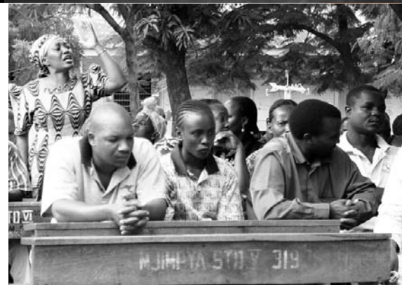
Teacher expresses concern for children at Mji Mpya

Mkombozi has for years worked with Majengo ward in Moshi, and has played a key role in investigating and addressing the underlying causes of child migration to the streets. Mkombozi is currently continuing its work to strengthen the local government's ability and consciousness in caring for children who live in difficult situations. Also, as part of the intervention "Helping adults to better care for vulnerable children", Mkombozi's Community Engagement group has now started reaching out to parents and primary school teachers in Majengo by raising awareness on why children run to the streets, what is considered abusive to children and how to better protect them - all with the aim to strengthen the community's responses to local child vulnerability.