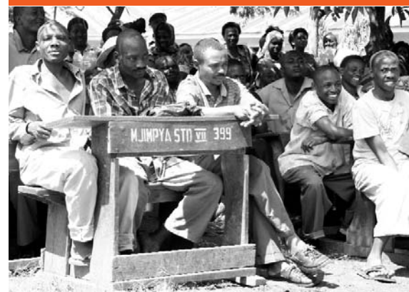
Parents discussing the upbringing of their children